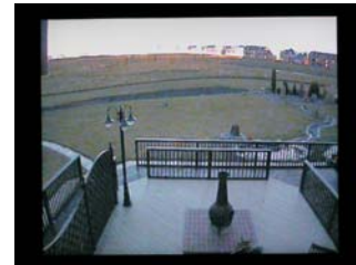
Our VLD dome

The above images were taken at midnight with the light measurement of 0.03 Lux