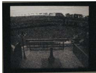
High end colour/mono